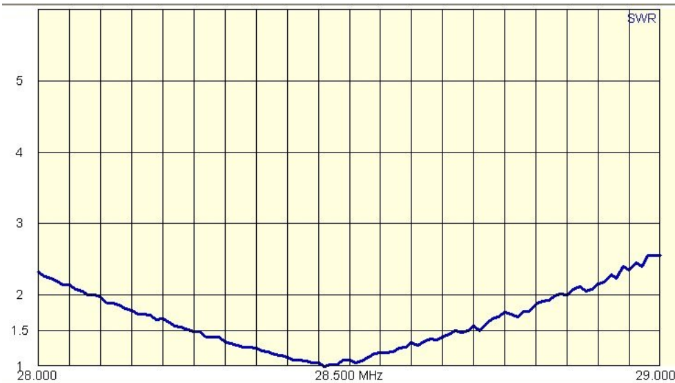
TYPICAL V.S.W.R. PLOT