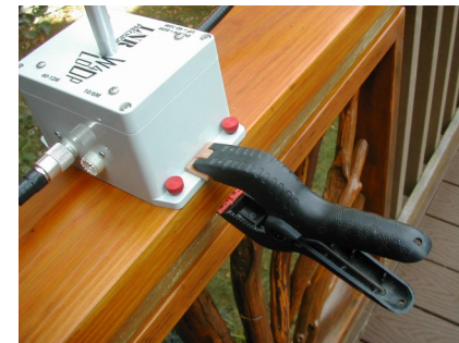
DETAIL SHOWING THE TABLE/RAIL CLAMP